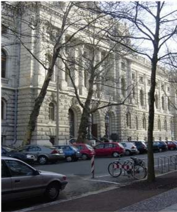
Biblioteca Albertina, Universitätsbibliothek Leipzig

http://www.dartmouth.edu/~wessweb/nl/Fall04/nedbook.html